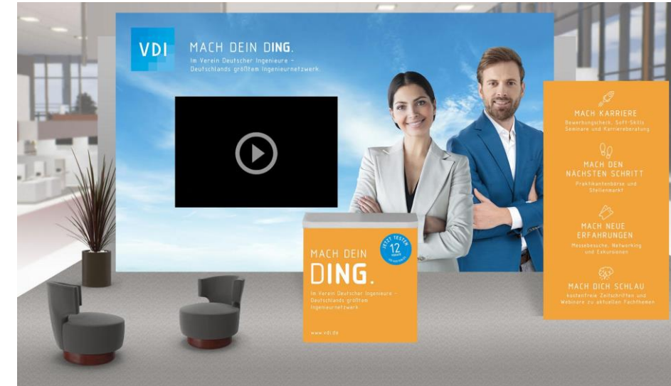
Example of an exhibition stand - VDI